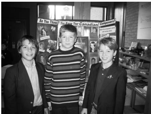
Students enjoying Canada Music Week festivities organized by ORMTA Newmarket & Area Branch