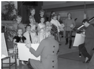
Music for Young Children students

M oncton - On November 22, 2015, the Moncton Music Teachers' Association held their annual recital to celebrate Canada Music Week. We were treated to twenty seven performers, showcasing their talents. Many of these performers were current or former Music for Young Children students