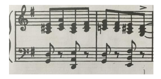
Fig. 3 "Mouvement Perpetuel" mm. 27-28. (Henri Dutilleux, Au Gré des Ondes: Six petites Pièces pour Piano . Paris, France: Alphonse Leduc Éditions Musicales, 1946).

Modal harmonies are particularly evident in the opening measures of the first movement, "Prélude en Berceuse" shown below. Ostensibly written in the key of B minor, Dutilleux fluctuates between a F natural and F sharp in both the left-hand accompaniment and the right-hand melody. This causes the piece to sound unstable to the ears of the audience, an effect which is enhanced by missing downbeats in the left-hand. This instability is appropriate, as it contributes to the sensation of rocking indicated by the description "en berceuse" ("in a cradle") in the title of the movement. Because of this instability, the audience is left questioning the final destination of the music, providing interest for both performer and audience.