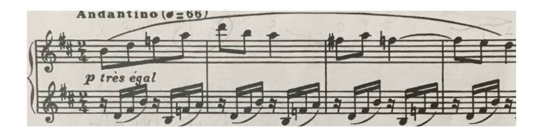
Fig. 4 "Prélude en Berceuse" mm. 1-4. (Henri Dutilleux, Au Gré des Ondes: Six petites Pièces pour Piano . Paris, France: Alphonse Leduc Éditions Musicales, 1946).

Modal harmonies are particularly evident in the opening measures of the first movement, "Prélude en Berceuse" shown below. Ostensibly written in the key of B minor, Dutilleux fluctuates between a F natural and F sharp in both the left-hand accompaniment and the right-hand melody. This causes the piece to sound unstable to the ears of the audience, an effect which is enhanced by missing downbeats in the left-hand. This instability is appropriate, as it contributes to the sensation of rocking indicated by the description "en berceuse" ("in a cradle") in the title of the movement. Because of this instability, the audience is left questioning the final destination of the music, providing interest for both performer and audience.