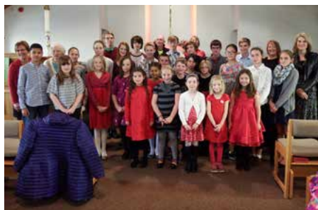
2016 North Bay

North Bay branch celebrated the beginning of Canada Music Week® a bit early but with great enthusiasm with their pre-Canada Music Week® Recital, followed later in the month by their "Honour Recital". Top students from the previous year's RCM examinations were recognized.