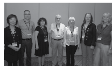
Quebec - Yukon