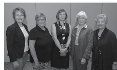
New Brunswick - Newfoundland Nova Scotia