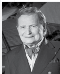
Byron Janis pianist