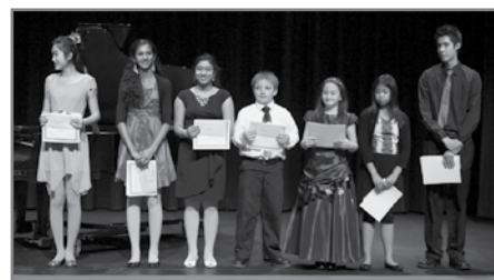
Fort McMurray Branch