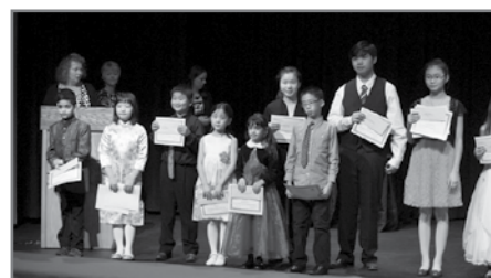
Fort McMurray Branch

reports: The Fort McMurray Music Teachers' Association Annual Awards and Scholarship Recital was held on November 22, 2013 in celebration of Canada Music Week. Our event celebrates all First Class Honour students within the Regional Municipality of Wood Buffalo over the past year. We presented 82 Certificates of Excellence, and 31 scholarships totalling $10,400 were given. 22 students performed for the recital portion, and a reception followed.