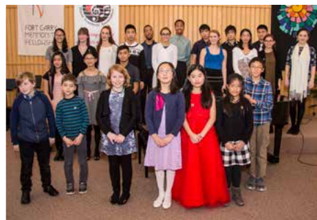
CMW in Winnipeg