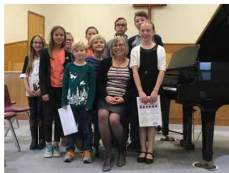
CMW in Southwestern MB