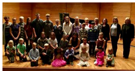
CMW in Brandon